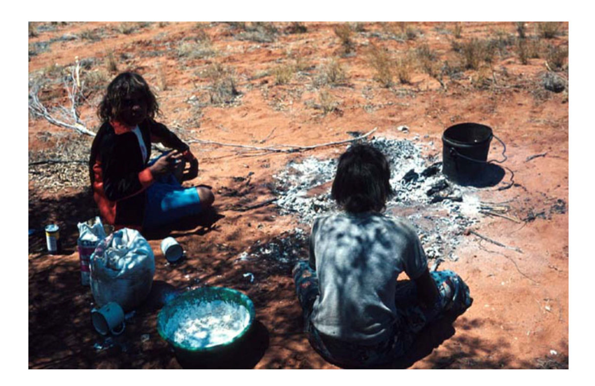
Sitting around the fire and making damper from wattle and other native seeds is a great place to share stories from the day and the past.