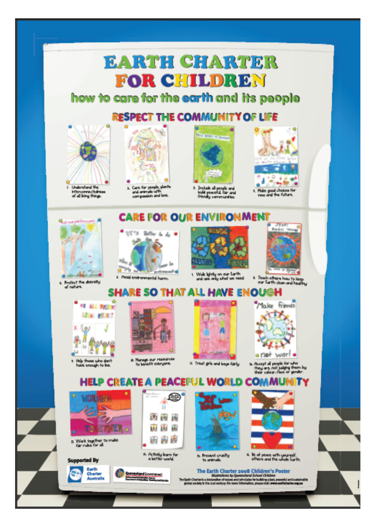
Resource 8: Earth Charter Children's Poster