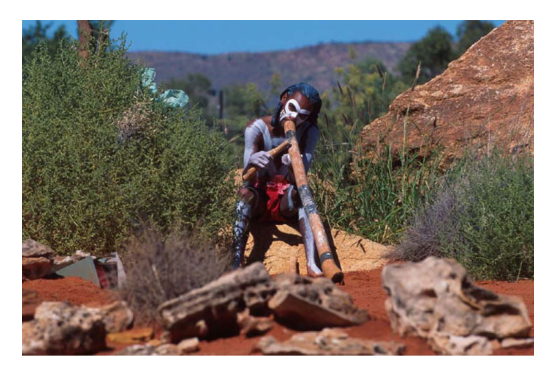
The didgeridoo and songs of Aboriginal people also translate stories. Some of these stories talk about he movements and significance of the ancestors and the creators of all.