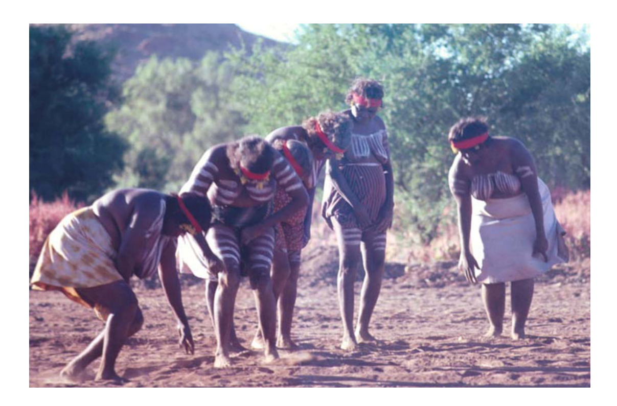
'Inma' (Pitjantjatjara name for dance and song), Ernabella - South Australia. The Pitjantjatjara people tell their Dreaming stories through traditional dances and songs.